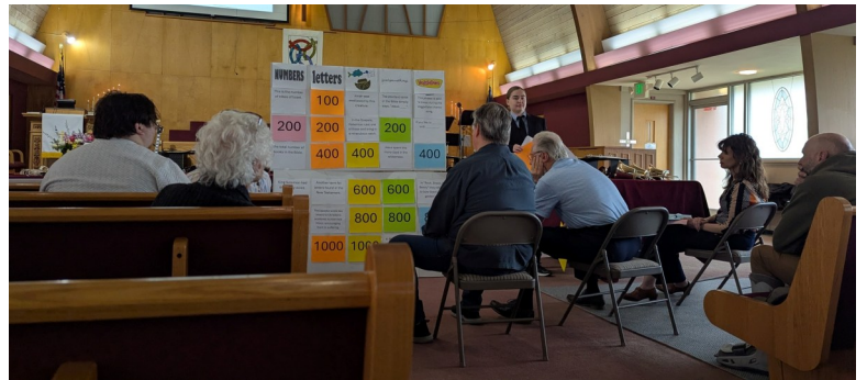
Youth Sunday Bible Jeopardy

To use one of these items, you can check it out of our medical supply closet. Make sure to use the sign-out sheet so we can keep track of items!