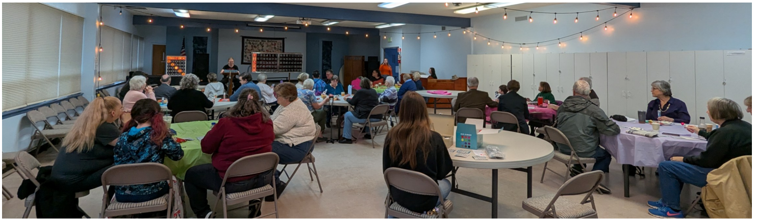
Youth Bingo Fundraiser