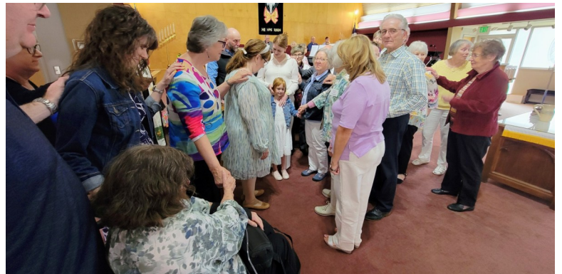
Easter Sunday Laying of Hands after Baptism