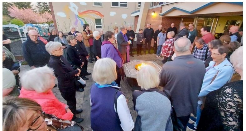
Maundy Thursday Prayer Fire